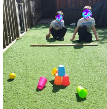
Supports physical development and turn taking with adults/siblings.

Can you make a game using toys you have at home?