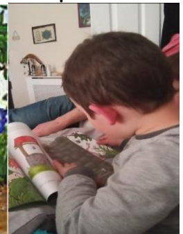
Supports reading and speaking and listening