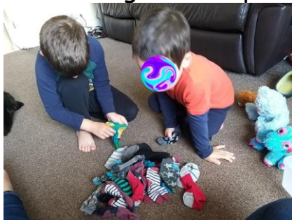
Supports pattern matching and physical development.

Can you find the matching socks and put them together in pairs?