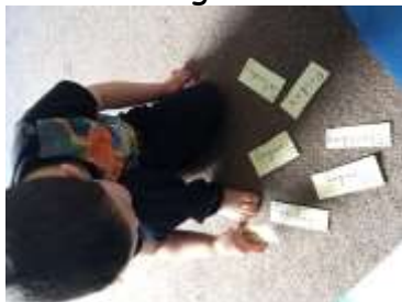
Supports understanding of the world.

Can you talk about what day it is? What is the weather like today? Can you remember the days of the week song from nursery and sing it?