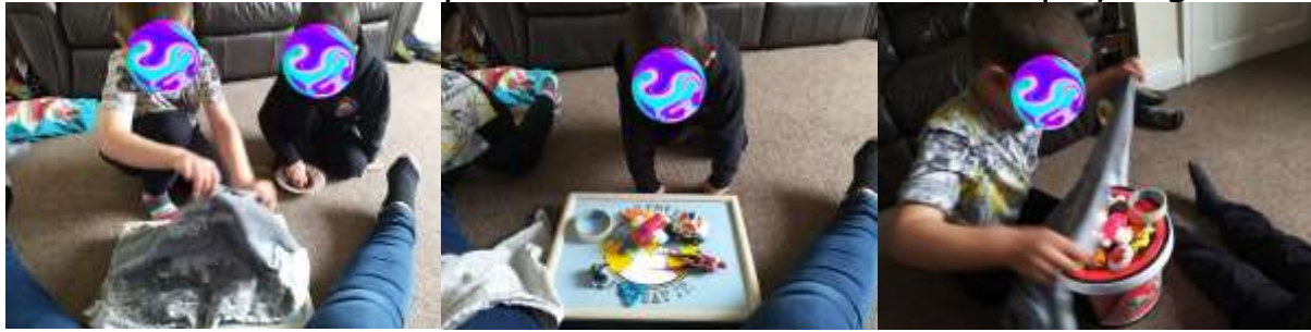
Supports language and communication and problem solving.

Can you make a memory game? We used items from around the house, covered them and I took one away. The boys had to work out which item was missing. After a few turns, they decided to make their own to play together.