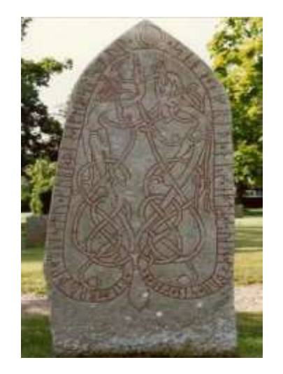
Use the runes to write your name.