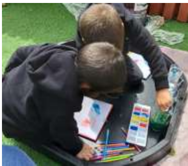
Supports art and design & understanding of the world.

Can you explore colours? We froze paint and mixed up different colours. You could also do a colour hunt, sort your toys into their colours or play colour I-Spy.