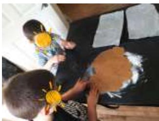
Supports following instructions.

Can you help to bake or cook? We made gingerbread biscuits using this simple recipe - https://www.bbcgoodfood.com/recipes/gingerbread-men-0