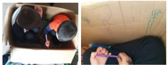
Supports writing and physical development.

Can you make marks in different ways? We had an empty box so we decorated it with our pictures.